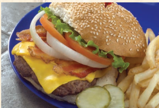
Bacon Cheese Burger Topped with crisp bacon and cheddar cheese 7.69